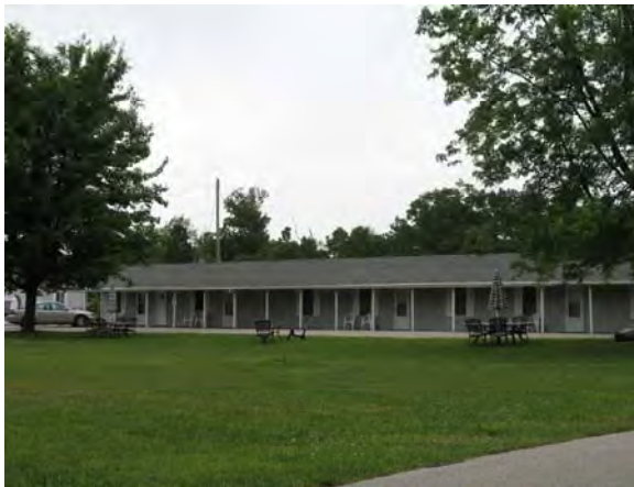
3942 Memorial, North Muskegon Snug Harbor Motel