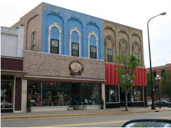
103 E. Colby, Whitehall The General Store