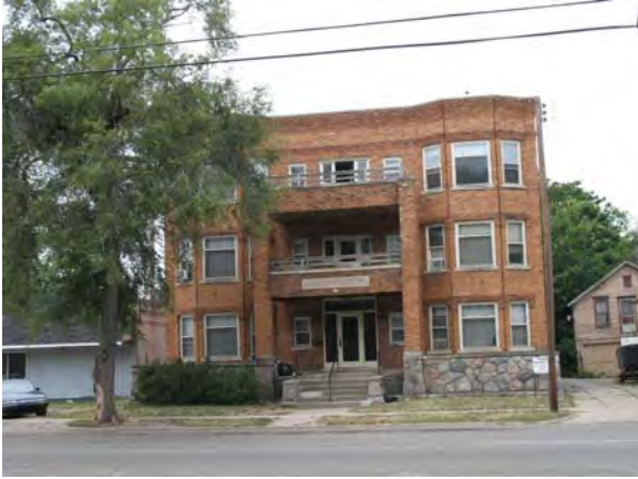
Peck Street, Muskegon Kensington Apartments