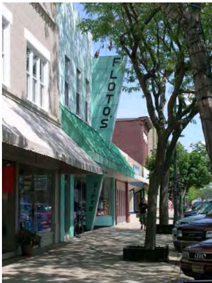
123 Washington, Grand Haven Floto's