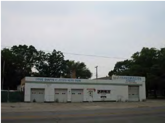
2501 Peck Street, Muskegon Heights Bill's Transmission

This former Texaco gas station building is an example of a revolutionary new building design introduced in 1936. The design was developed by Walter Dorwin Teague, a pioneer in industrial design, and was used by Texaco until the 1960s.