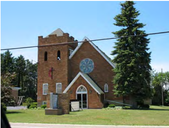
Blue Star Highway, Ganges Township Church