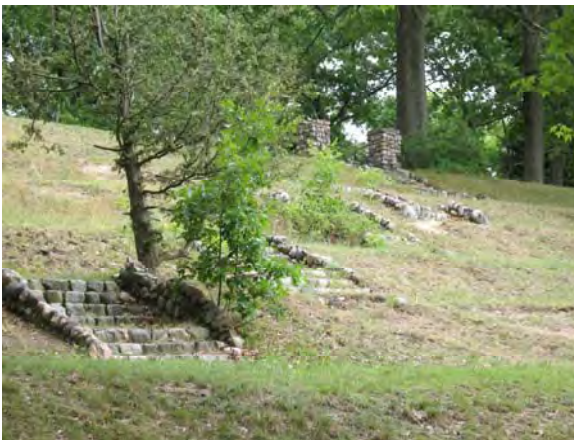
3335 Mona View, Muskegon Heights Mona View Cemetery

They also acted as a fraternal aid organization for Polish immigrants to America.