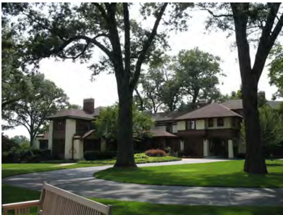
116 Hazel Avenue, Holland Marigold Lodge