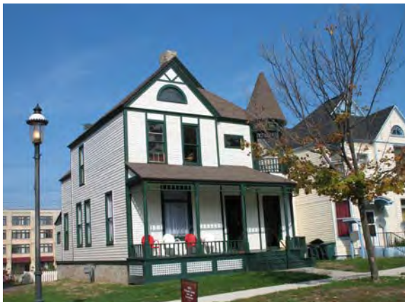
504 W. Clay Street, Muskegon Scolnik House Museum

Sherman Bowling Center opened in August 1958 with twenty-eight lanes; twenty-two more lanes were added in 1960.