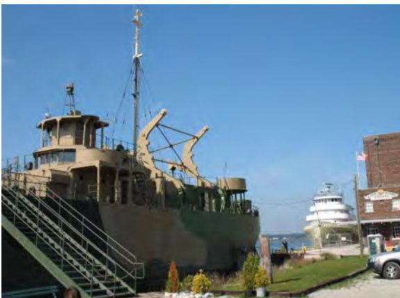
560 Mart Street, Muskegon LST 393

The Landing Ship Tank (LST) 393 was originally constructed in the Newport News, Virginia, shipyard in 1942. It transported troops and equipment to European battle fronts during World War II including the invasions of Salerno and Anzio and the invasion of Normandy in 1944. The ship was awarded four battle stars for its service and was decommissioned in 1946. After the war, the ship transported new automobiles between Muskegon and Milwaukee. The ship is owned by the USS Silversides and Maritime Museum in Muskegon.