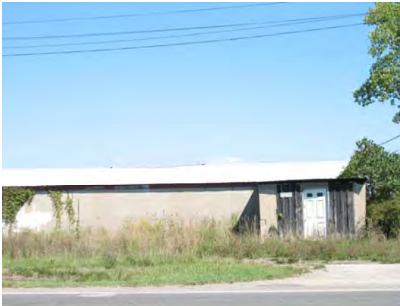
7200 Grand Haven Road, Grand Haven Agricultural Building