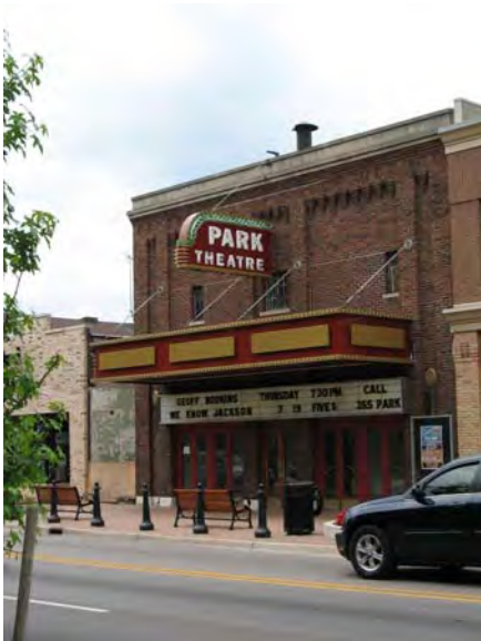
248 South River Avenue, Holland Park Theatre

This Greek Revival style church was built in 1857 and is one of the few buildings in Holland to survive the fire of 1871. It is listed on the National Register of Historic Places.