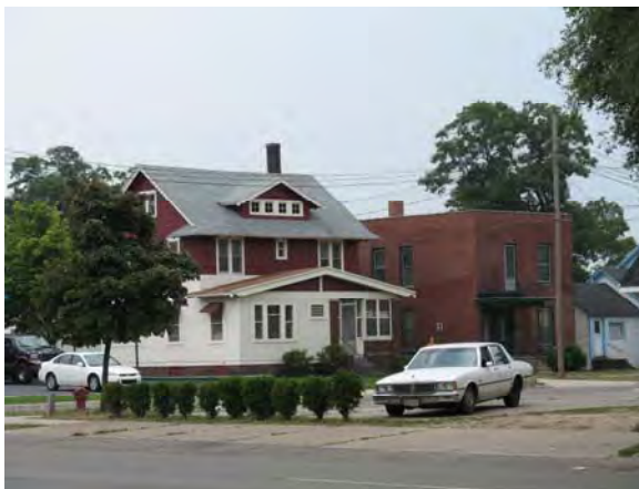
Peck Street, Muskegon

A commercial building constructed in 1913.