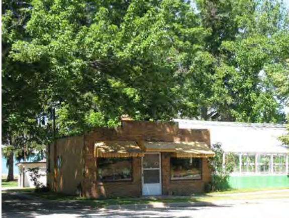
500 block S. Mears, Whitehall Florist