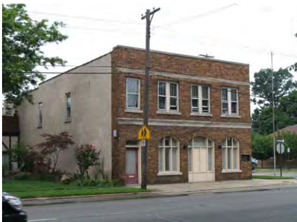
Peck Street, Muskegon Brick Commercial Building