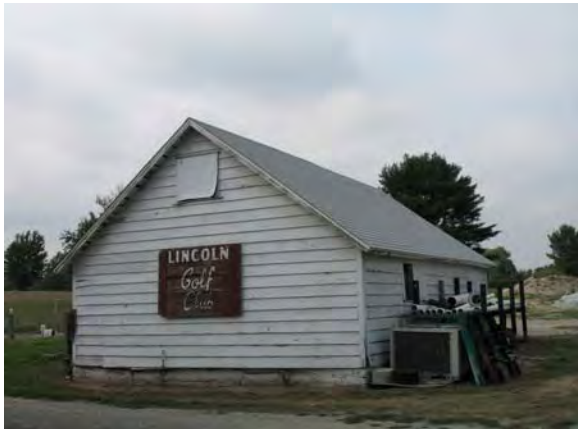
4907 Whitehall Road, Whitehall Lincoln Golf Club