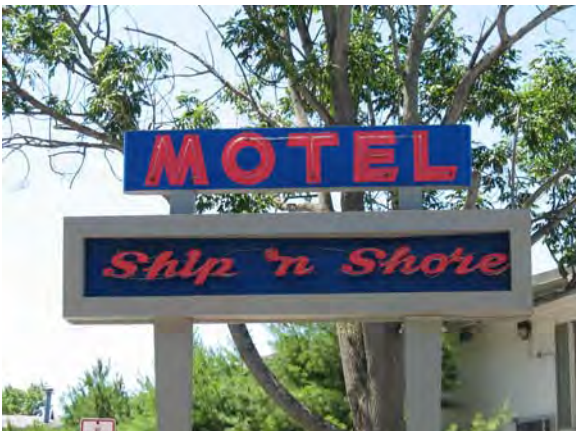
Ship 'n Shore Motel-Boatel, Saugatuck 528 Water Street

This motel built in the 1960s is in a location that allows boaters to dock in front of their rooms.