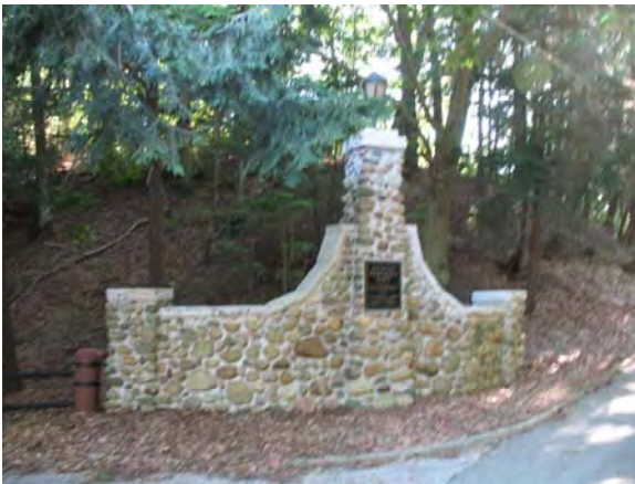
Duncan Park Lake Avenue