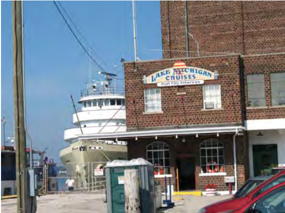
560 Mart Street, Muskegon West Michigan Dock and Market (The Mart Dock)