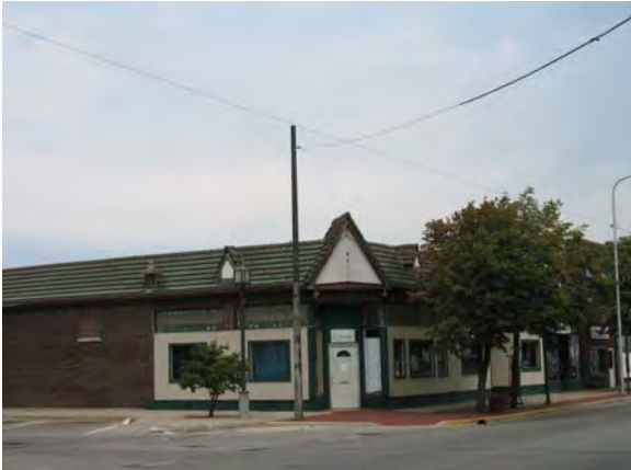
2731 Peck Street, Muskegon Heights Hope Lighthouse