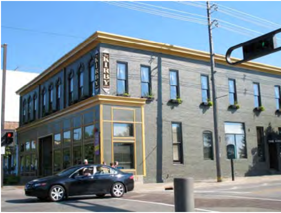
2 Washington, Grand Haven The Kirby House