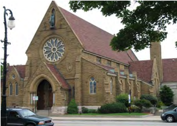
1006 Third Street, Muskegon St. Paul's Episcopal Church