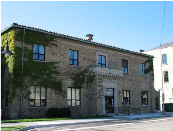
15 S. Third, Grand Haven Elks Lodge 200