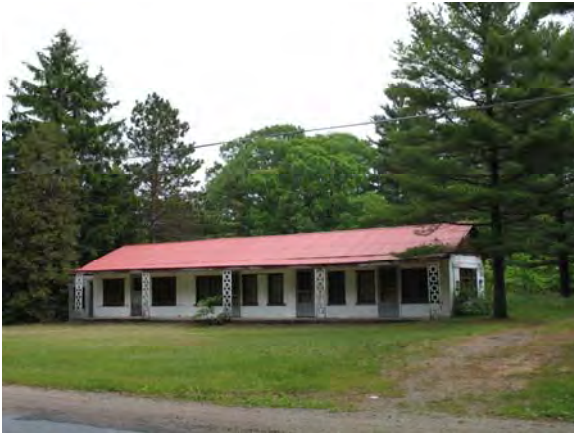
Scenic Drive, Muskegon Rustic Lantern Motel

The farmhouse and two six-room motel units, located just north of Pioneer County Park, are reminders of how tourism and the construction of the highway changed the economy of Muskegon County. The current owner replaced the asphalt roof with tin to preserve the resource. He is interested in rehabilitating the buildings.