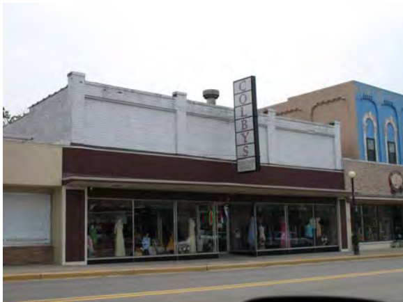
107 E. Colby, Whitehall Colby's Designer Outlet