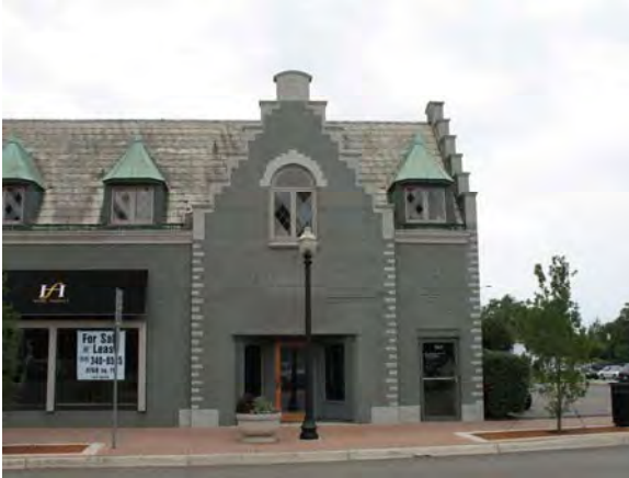
River Street, Holland New Dutch Gallery Building

The building demonstrates the Flemish architectural influences of Holland's commercial buildings.