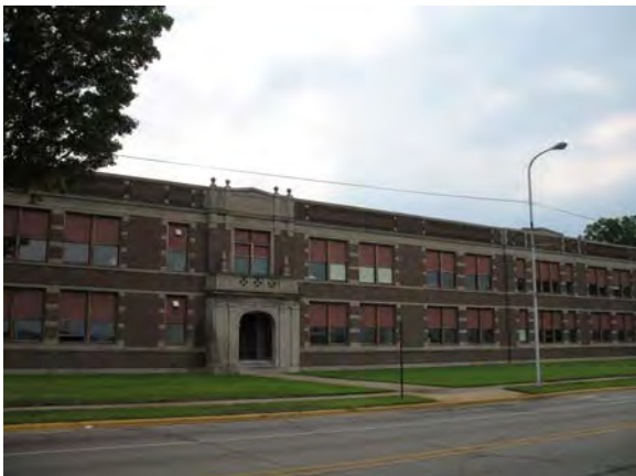
Peck Street @ Sherman, Muskegon Heights Central School