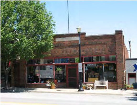
4574 Dowling, Montague Page's LLC

The Ohrenberger Block was built in 1930.