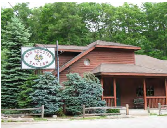
2998 Scenic Drive, Muskegon Red Rooster Tavern

The farmhouse and two six-room motel units, located just north of Pioneer County Park, are reminders of how tourism and the construction of the highway changed the economy of Muskegon County. The current owner replaced the asphalt roof with tin to preserve the resource. He is interested in rehabilitating the buildings.