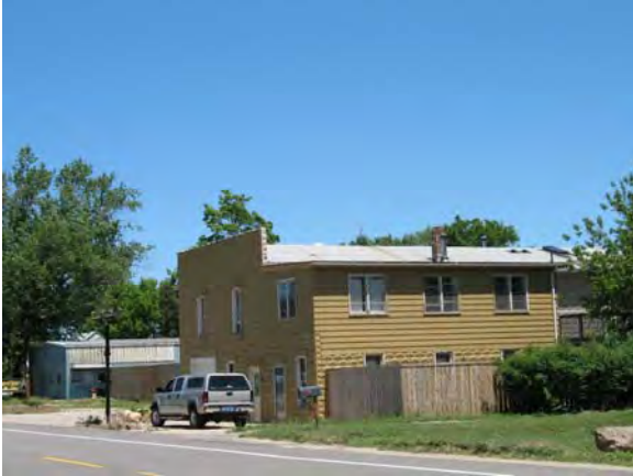
Blue Star Highway, Ganges Township