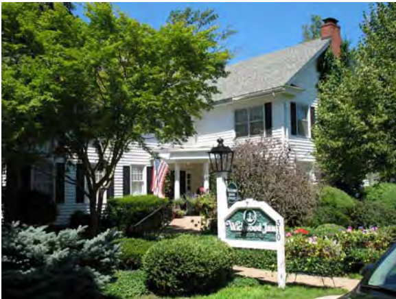
510 Butler, Saugatuck Wickwood Inn