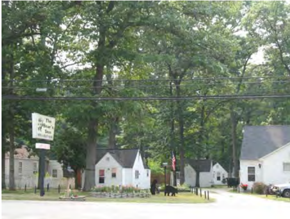
2165 Whitehall Road, Whitehall Bear's Den Motel