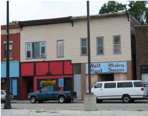
1125 Third Street, Muskegon Orphanage Tatoo and Walt Plant Building