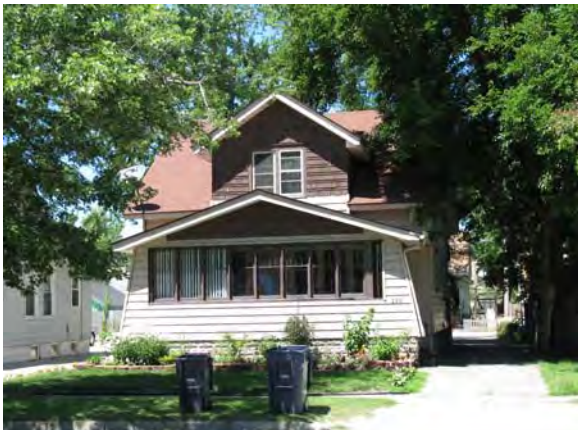
Seventeenth Street between Ottawa and Van Raalte, Holland Craftsman Bungalows

Many of the homes in this neighborhood of Craftsman bungalows have battered porch columns, a style common in West Michigan. These may have built by one developer.