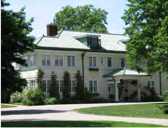
3656 Blue Star Highway, Saugatuck Belvedere Bed & Breakfast