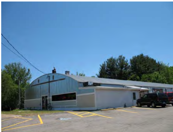
2948 Blue Star Highway, Douglas Blue Star Antique Pavilion