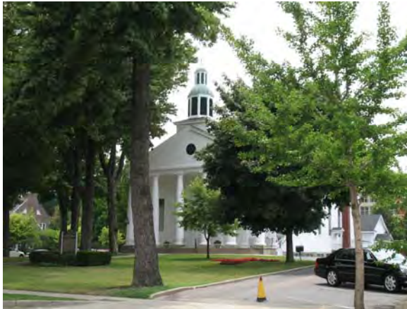
57 East Tenth, Holland Pillar Church

This Greek Revival style church was built in 1857 and is one of the few buildings in Holland to survive the fire of 1871. It is listed on the National Register of Historic Places.