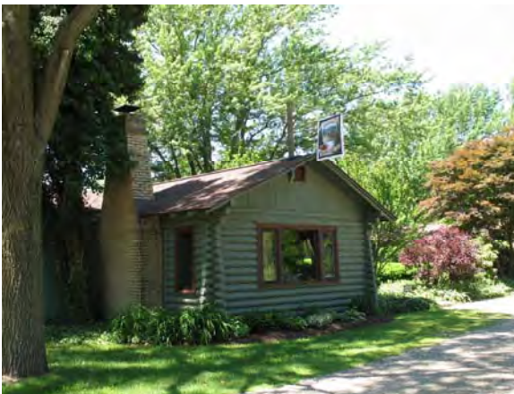
2790 Blue Star Highway, Saugatuck Hunter's Lodge