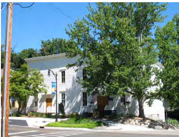
Center Avenue, Douglas Douglas Town Hall