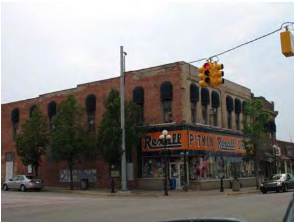
101 W. Colby, Whitehall Pitkin Rexall Drug