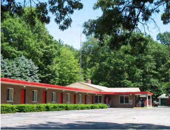
3353 Blue Star Highway, Saugatuck Timberline Motel