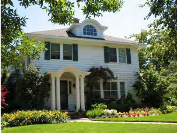
507 Butler Street Residence