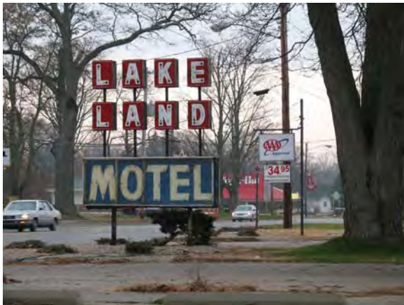
1002 E. Colby, Whitehall Lakeland Motel

Ruth Thompson, the first woman elected to the United States House of Representatives, was buried here in 1970.