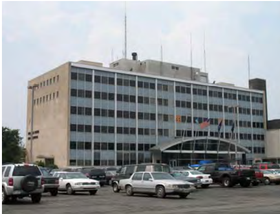
990 Terrace, Muskegon Hall of Justice

The Muskegon architectural firm of Magnuson & Sumner, which was established in 1948, designed this International style building. It was constructed in 1959. The firm also designed the St. Frances de Sales Parish School on McCracken Street in 1954.