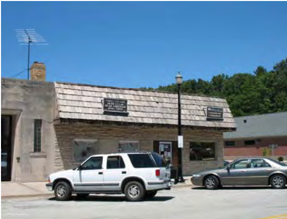
8747 Ferry Street, Montague Professional Building