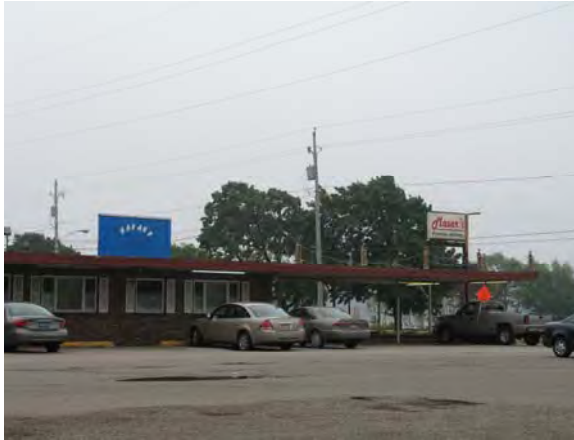
3690 Airline, Muskegon Masar's Drive-In