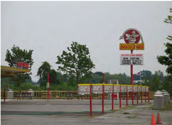
4454 Dowling, Montague Dog 'n Suds

Two music teachers from the University of Illinois-Champaign created the Dog 'n Suds drive-in restaurant chain in 1953. The business was an overnight success and by the 1970s there were over six hundred Dog 'n Suds franchises located in thirty-eight states. Today only sixteen Dog 'n Suds locations are still in operation—two are in Michigan. The proprietor of Montague's Dog 'n Suds also owns the drive-in on Grand Haven Road in Ottawa County.