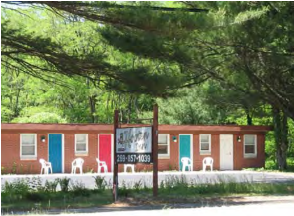
6541 Blue Star Highway, Saugatuck Hooten Inn