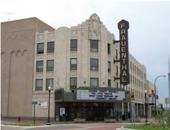
425 W. Western Avenue, Muskegon Michigan Theater (Frauenthal Center for the Performing Arts)