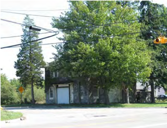
Grand Haven Road, Muskegon Concrete Block Building

This rock face concrete block farm building was probably built in the early 1920s.