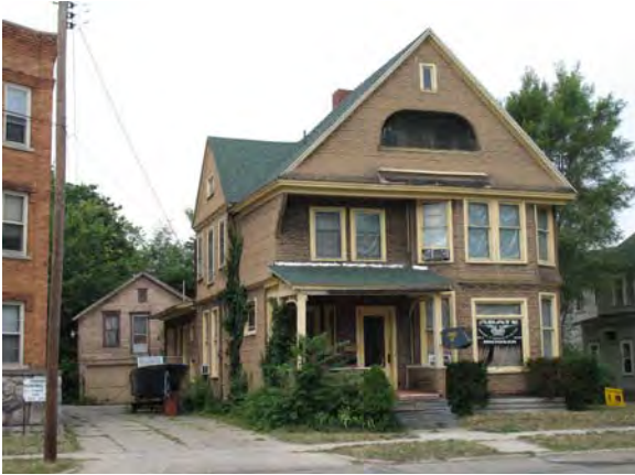
1239 Peck Street, Muskegon Sherman's Apartments