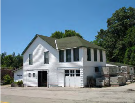
8789 Ferry, Montague Ramthun Building Materials