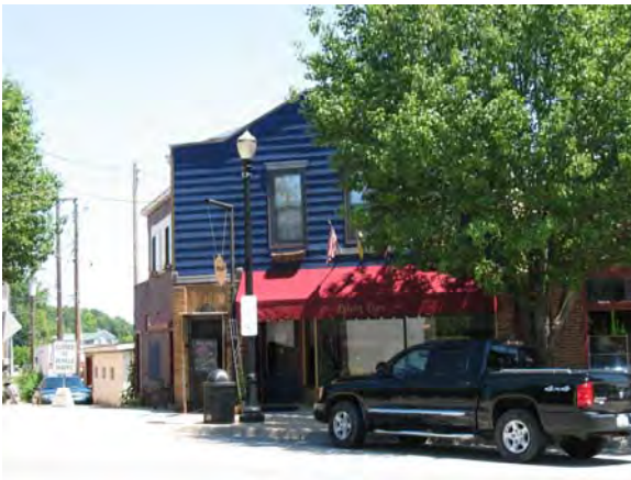
4578 Dowling, Montague Paisley Place

The Ohrenberger Block was built in 1930.