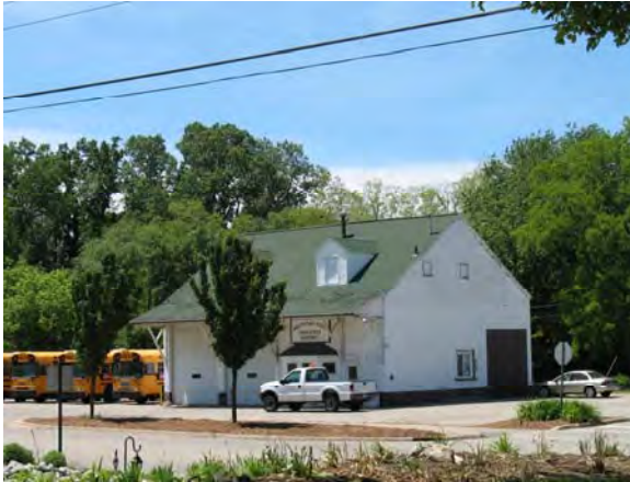
Saugatuck School Bus Garage Blue Star Highway, Douglas