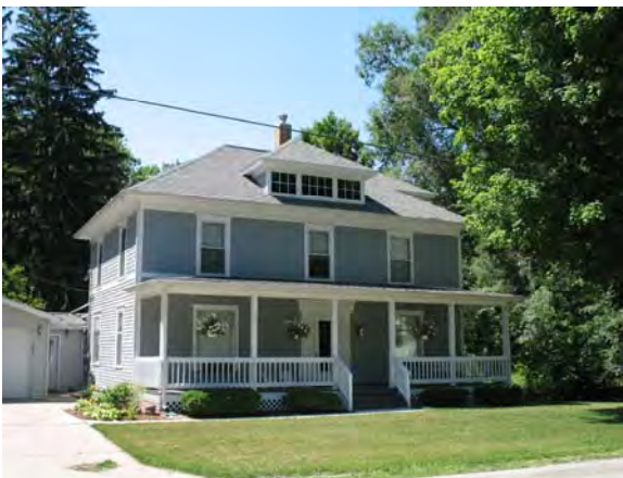
115 Main Street, Whitehall Swedentown Boarding House

In the late 1870s a large contingent of Swedes came to Whitehall to work in the village's lumber mill and tannery. By 1882 over seven hundred Swedes had settled in the White Lake area. In Whitehall the area roughly bounded by Main, Johannah and Johnson Streets became known as Swedentown.