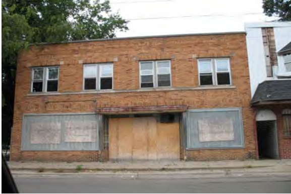
Peck Street, Muskegon Heights Commercial Building

this unprecedented success, the Muskegon Improvement Company decided to hold a second sale, this time building six model homes on existing lots to increase consumer interest.