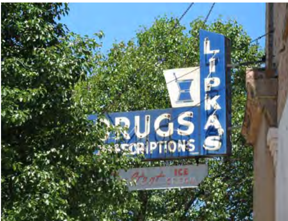
8718 Ferry Street, Montague Lipka's Soda Fountain (Lipka's Drugs)

Established in 1946 as a drug store and soda fountain by Glen Lipka, it was converted into a restaurant and soda fountain in 2002 by the Lipka family.