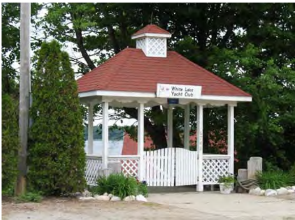
6478 South Shore Drive, Whitehall White Lake Yacht Club