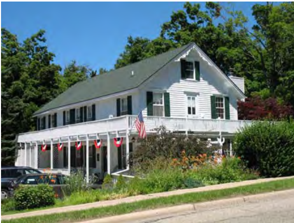
888 Holland, Saugatuck The Park House