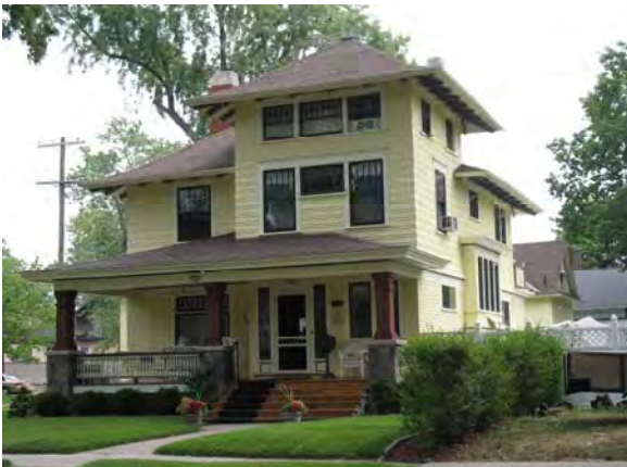
1562 Peck Street, Muskegon Residence

This Art Moderne style building was originally an apartment complex.