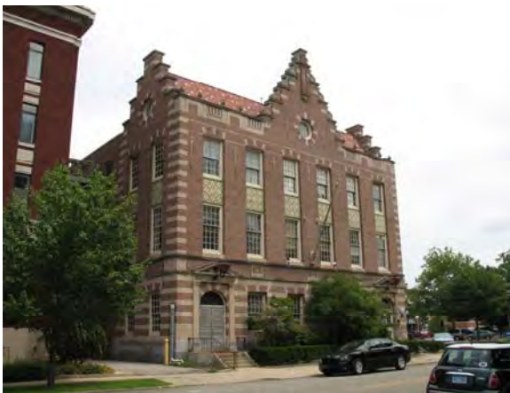
Tenth and Central, Holland Bell Telephone Building

Built in 1892 as the Holland City State Bank, the building is constructed of Waverly Stone, a regional stone quarried east of the city.