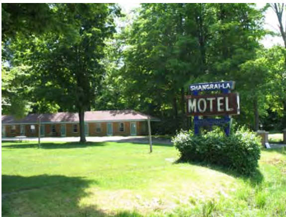
6190 Blue Star Highway, Saugatuck Shangrai-La Motel