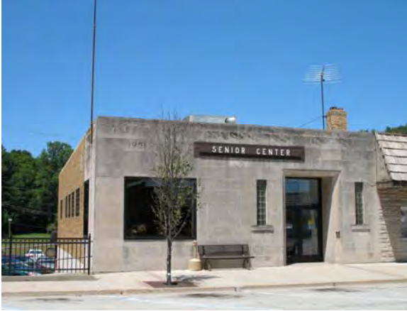
8741 Ferry, Montague White Lake Senior Center