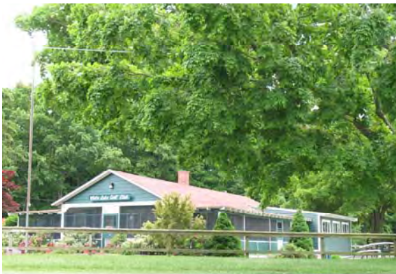
6777 South Shore Drive, Whitehall White Lake Golf Club

Established in 1916, the original course was designed by E. E. Roberts.