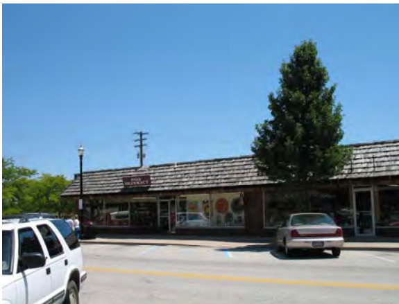
8744 Ferry Street, Montague Todd Pharmacy