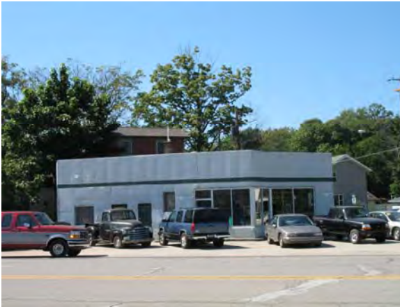
4616 Grand Haven Road, Grand Haven Goose's Service Towing

This rock face concrete block farm building was probably built in the early 1920s.