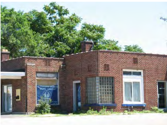
530 South Shore, Holland Brick Commercial Building