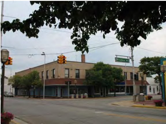
Broadway and Peck Street, Muskegon Heights Commercial Building

This rock face concrete block garage was built around 1920.