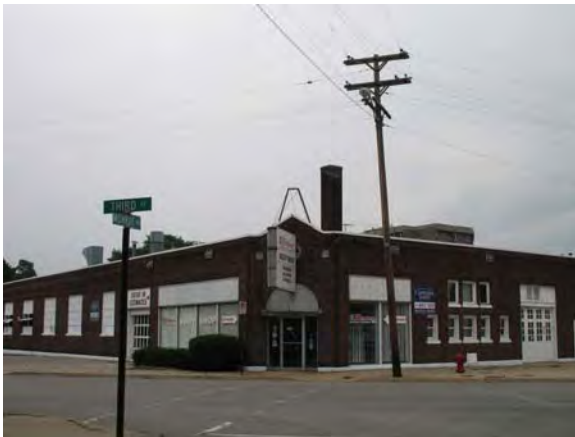
1144 Third Street, Muskegon Betten Chevrolet Cadillac Body Shop