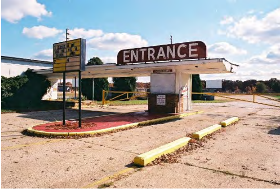
920 E. Summit, Muskegon Getty Drive-In Theater