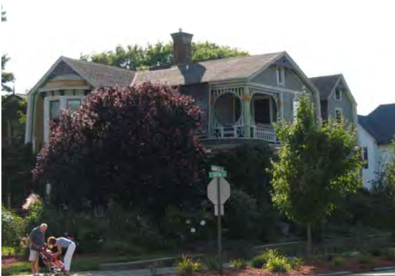
Highland Drive, Grand Haven Highland Park Association