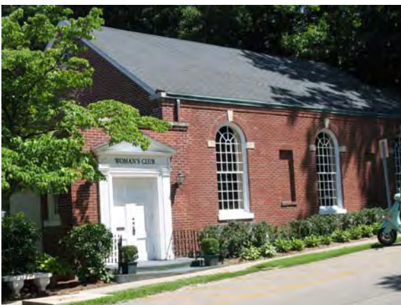
303 Butler Street, Saugatuck Women's Club

In 1926 architect Carl Hoerman redesigned the Village Hall in the Colonial Revival style as part of an effort to increase Saugatuck's appeal as a tourist destination.