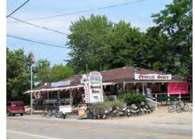
Ottawa Beach Store