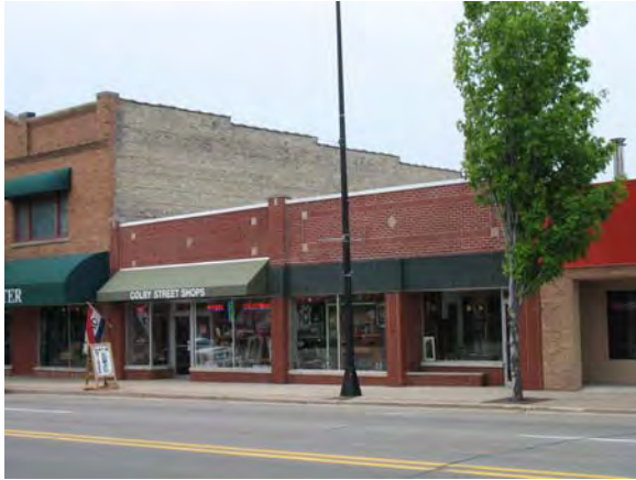
106 E. Colby, Whitehall Colby Street Shops