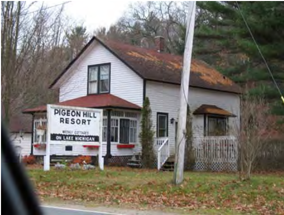
7147 Old Channel Trail, Montague Pigeon Hill Resort