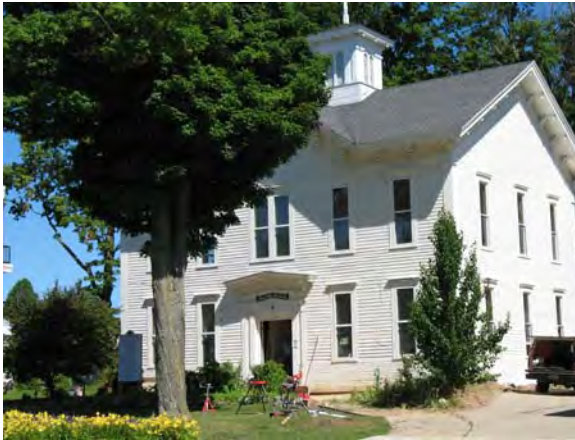
Center Avenue, Douglas Douglas Union School