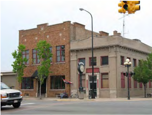
102 W. Colby, Whitehall State Bank Building (right)