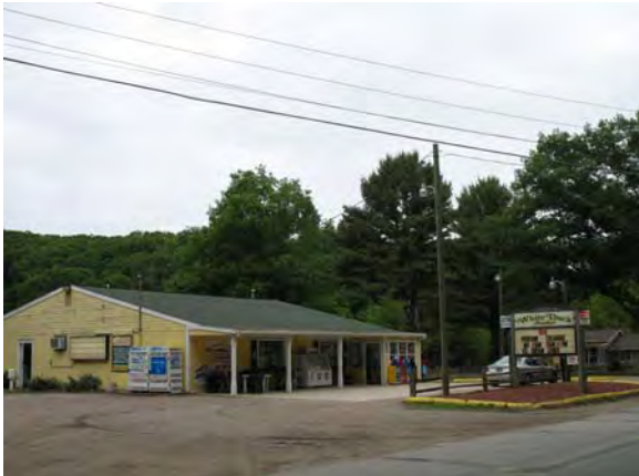
5333 Scenic Drive, Muskegon White Duck Country Market