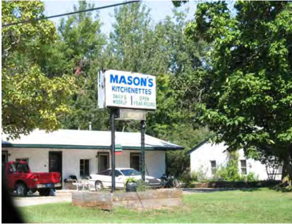
7312 Grand Haven Road, Grand Haven Mason's Kitchenettes