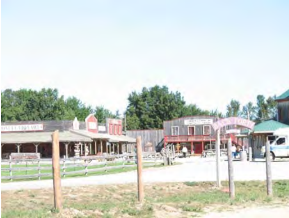
5900 Water Street, Rothbury Double JJ Resort

The original route of the West Michigan Pike through Oceana County followed what is today known as Oceana Drive through Rothbury, New Era, Shelby and Hart to Smith Corners where it ran west to Pentwater. Oceana County retains much of its rural character—the county boasts it has only one stoplight, which is located in Hart.