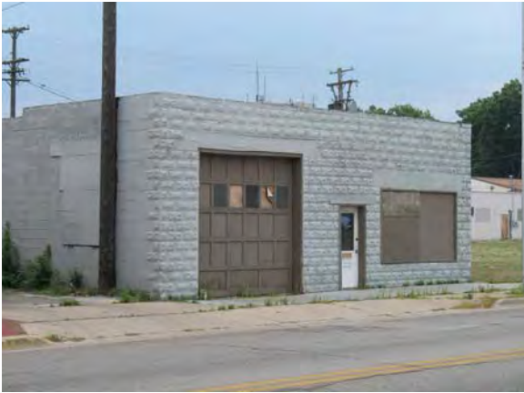
Peck Street, Muskegon Heights Garage

This rock face concrete block garage was built around 1920.