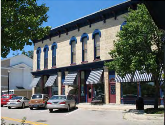
8695 Ferry, Montague Arts Council of White Lake