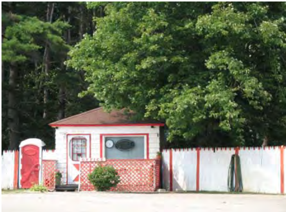
Whitehall Road, Whitehall