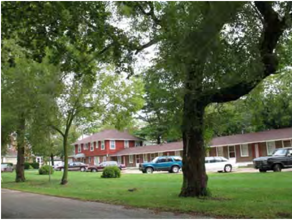
S. Shore Drive, Holland Parkville Motel

An example of a post World War II “mom and pop” motel.