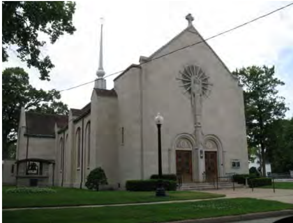
1716 Sixth Street, Muskegon Saint Michael's Catholic Church

The church was established in 1912 to serve the city's Polish population.