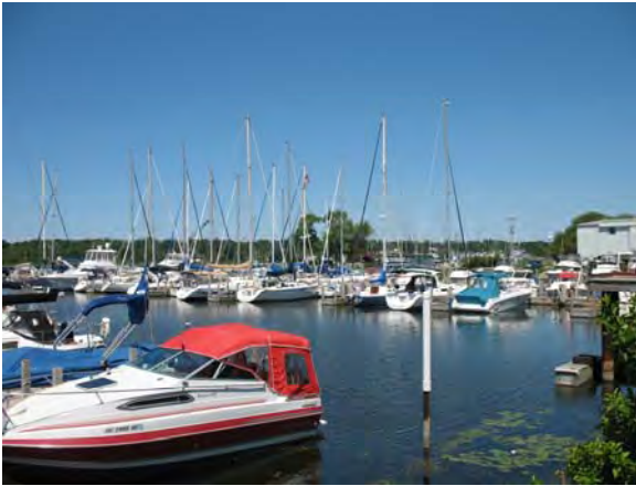
302 S. Lake, Whitehall Crosswinds Marina