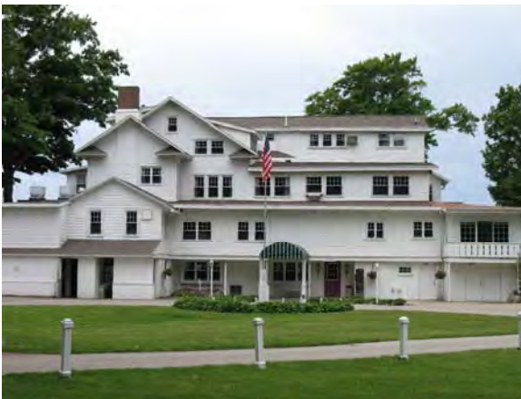
5207 Scenic Drive, Muskegon Michilinda Resort

Known as the Michilinda Pines Resort in 1890, the historic inn has undergone extensive remodeling. The landscape still retains its turn of the century feeling and features.