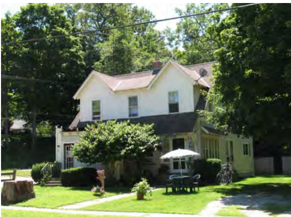
237 Francis, Saugatuck Residence

Built in 1940 it was originally an apartment house