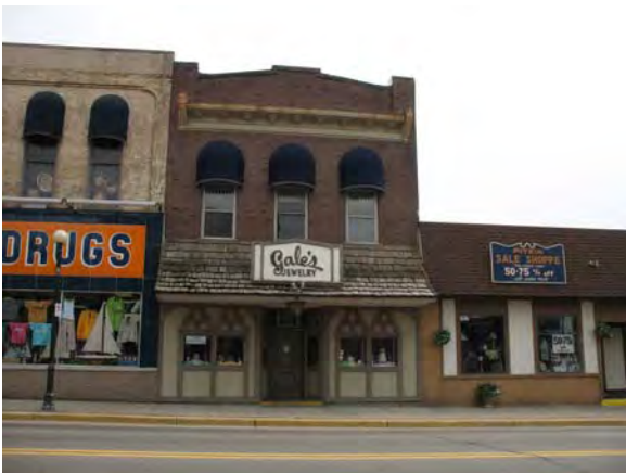
105 W. Colby, Whitehall Gale's Jewelry