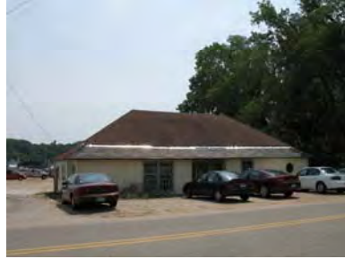
Ottawa Beach Boat House