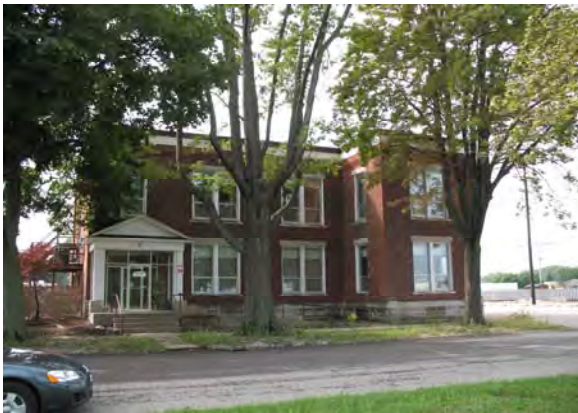
South Shore and Homestead Avenue, Holland H. J. Heinz Company

Originally the West Michigan Laundry, the company became West Michigan Uniform in 1963.