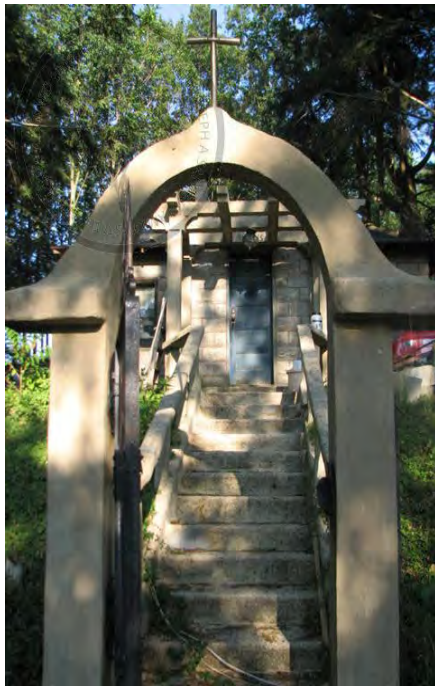
Old Channel Trail, Montague Joseph Sadony Estate, Valley of the Pines