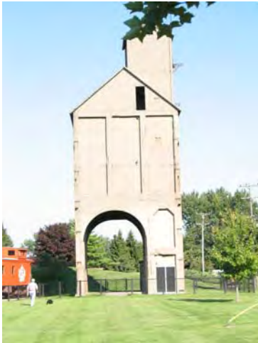
N. Harbor Drive, Grand Haven Coal Tower

The railroad depot was built by the Grand Trunk Railroad in 1870.