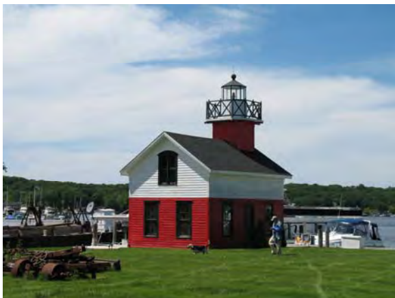
Lake Kalamazoo, Blue Star Highway, Saugatuck Replica Lighthouse

A 1907 passenger ferry that was once operated by the Canadian Pacific Railway on the Georgian Bay and Upper Lake Superior. The ship was retired in 1965 and moved to Saugatuck in 1967. The ship is anchored at what was known as the Red Dock, a former fruit shipping port for local farmers.