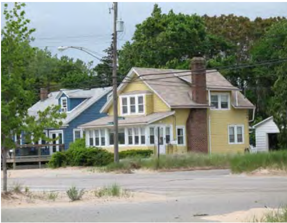
Edgewater Street, Muskegon Beachwood-Bluffton Neighborhood

This firehouse is a re-creation of the original Hackley House Company #2 that operated in Muskegon between 1875 and 1892. The re-created firehouse was built in 1976 during the Bicentennial.