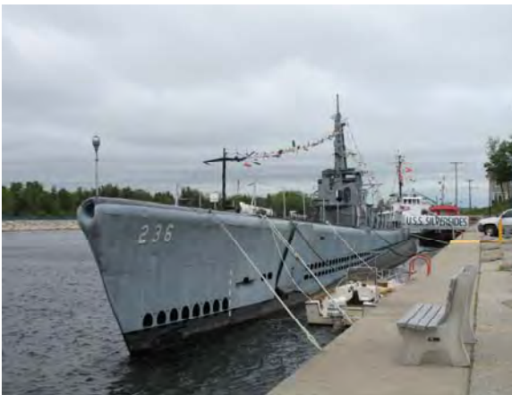
1346 Bluff Street, Muskegon Great Lakes Naval Memorial and Museum

vaudeville performers began building cottages in the area. By 1911 the colony was thriving with over two hundred performers in residence. A clubhouse was constructed and an annual vaudeville show was established in 1917. Joe Keaton's son, Buster Keaton, spent his summers in Bluffton during his youth. In the 1930s he became one of the world's most popular silent film comedians.