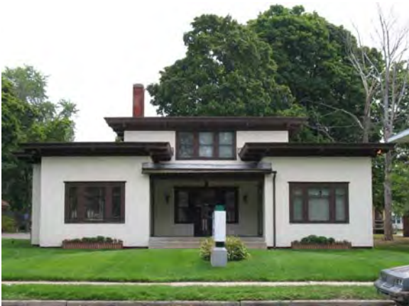
1516 Peck Street, Muskegon Michigan Works

A Prairie-style house and adjacent apartment building.