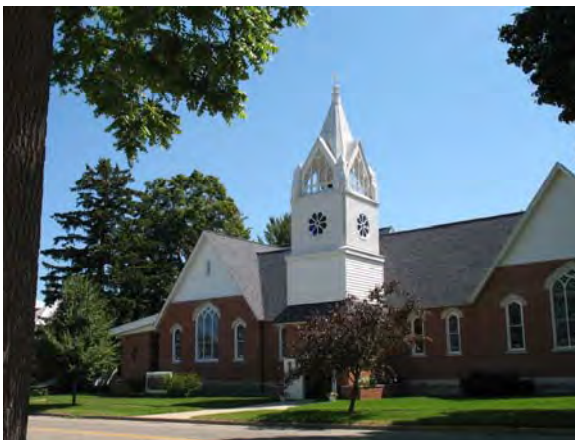
1101 S. Mears, Whitehall Swedish Lebanon Lutheran Church

A group of Danes, Swedes and Norwegians who came to Whitehall to work in the lumber industry and tannery organized the Scandinavian Lutheran congregation in 1872. The Swedes later withdrew to join the Augustana Synod and in 1877 built the Swedish Evangelical Lutheran Lebanon Church of Whitehall.