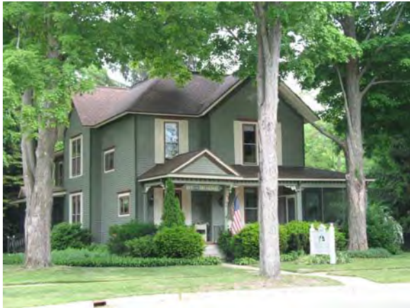
303 S. Mears, Whitehall White Swan Inn