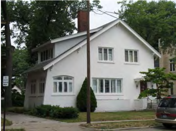
Peck Street, Muskegon Craftsman Bungalow