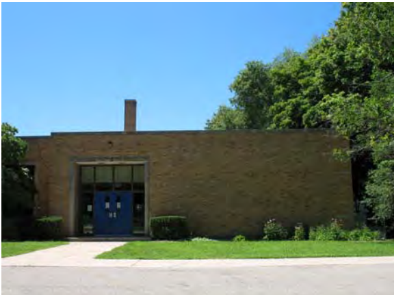
752 Lugers Road, Holland Lakeview Elementary School