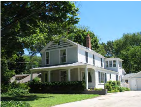
1036 Holland, Saugatuck Residence