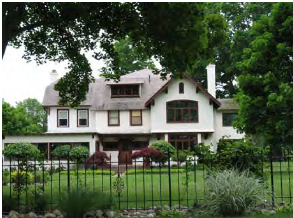
South Shore Drive, Whitehall Crosby Park