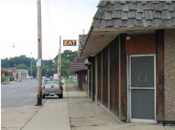
1928 Peck Street, Muskegon Commercial Strip

A classic neon "Eat" sign at the site of a former restaurant.