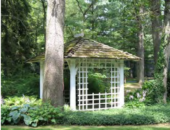
Ottawa Beach Road, Holland Waukazoo Resort