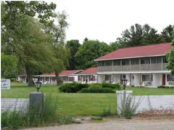
5700 Scenic Drive, Muskegon Lakeside Inn