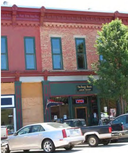
8726 Ferry Street, Montague Book Nook & Java Shop