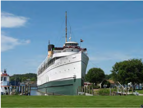
Lake Kalamazoo, Blue Star Highway SS Keewatin

Originally the Plaza Tourist Court, a 1950s era motel with little decoration, the motel was completely remodeled in 2004 to reflect the Arts and Crafts style.