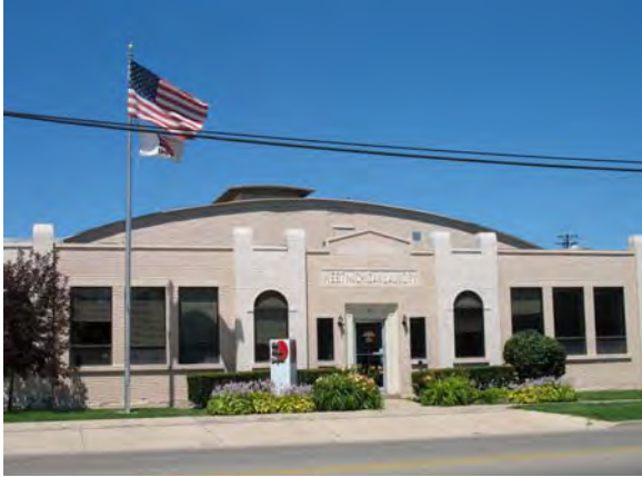
407 W. Seventeenth Street, Holland West Michigan Uniform

Originally the West Michigan Laundry, the company became West Michigan Uniform in 1963.