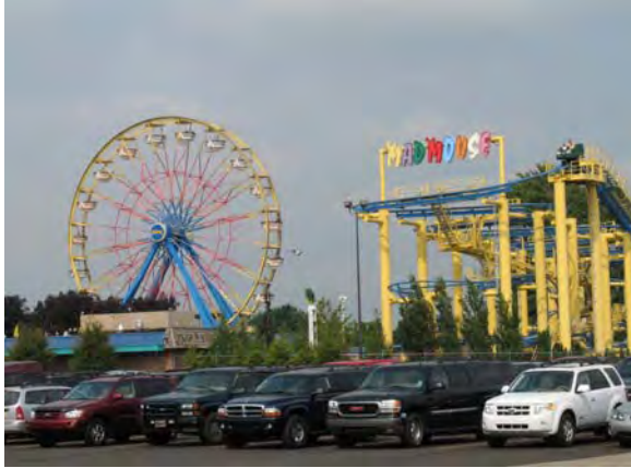
4750 Whitehall Road, Whitehall Michigan Adventure Amusement and Wild Water Adventure

Michigan Adventure was founded in 1956 as a petting zoo called Deer Park. In 1968 it was purchased by Roger Jourden who changed the name to Deer Park Funland and added rides like the Tilt-a-Whirl and Scrambler. In 1988 a roller coaster was added and the name was changed to Michigan Adventure. The Wildwater Water Park was added in 1991. Cedar Fair Entertainment Company, who operates the Cedar Point Amusement Park in Cedar Point, Ohio, purchased the site in 2001.