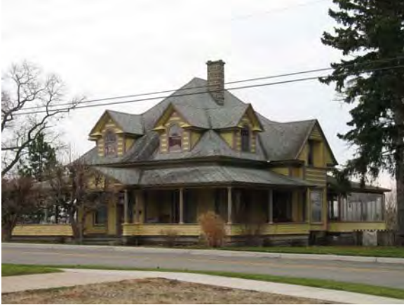
Old Channel Trail, Montague Queen Anne Cottage