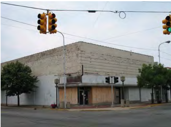
Broadway and Peck Street, Muskegon Heights Commercial Building