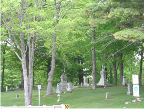
1300 Block Colby, Whitehall Oakhurst Cemetery

Ruth Thompson, the first woman elected to the United States House of Representatives, was buried here in 1970.