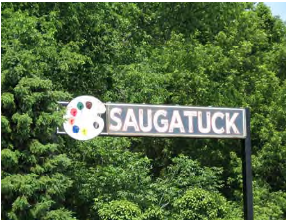
Lake Street and Blue Star Highway

The resources below are found along the original route of the West Michigan Pike, which followed Lake, Culver, Butler, Francis, and Holland streets.