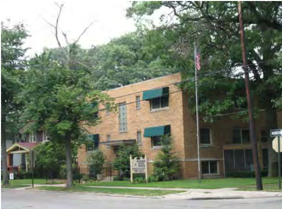
1631 Peck Street, Muskegon Muskegon Rescue Mission

This Art Moderne style building was originally an apartment complex.