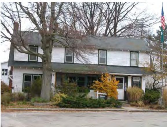
6905 Old Channel Trail, Montague Old Channel Inn