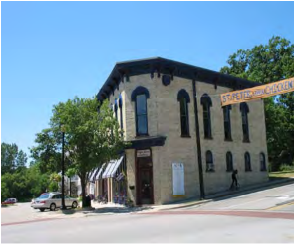
8701 Ferry, Montague White River Gallery