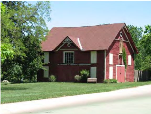
Blue Star Highway, Ganges Township Barn