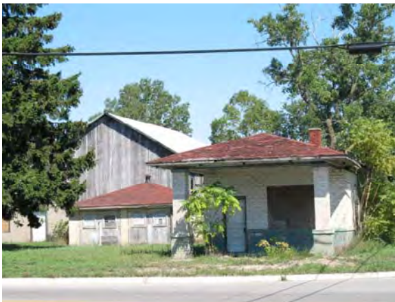
Grand Haven Road, Grand Haven 1920s Gas Station and Farm Buildings