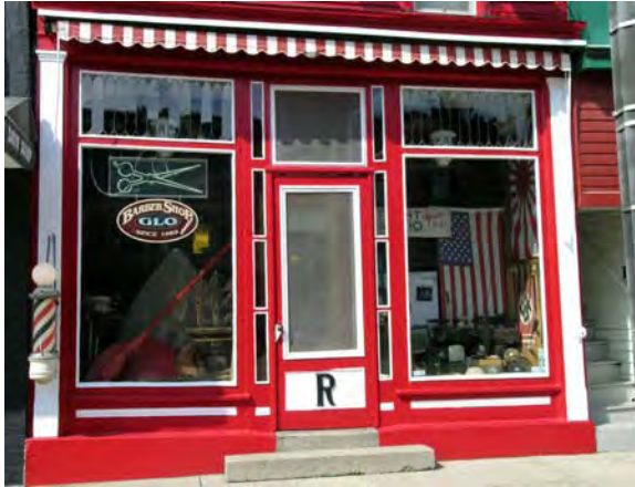
209 Washington, Grand Haven Glo Barber Shop