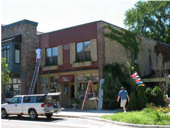
33 Center Avenue, Douglas French Cottage