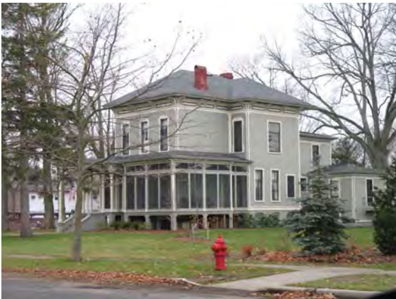
Old Channel Trail, Montague Italianate Cottage