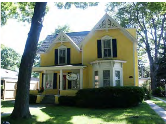
415 Division, Whitehall A Finch Nest Bed & Breakfast