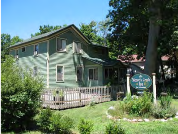
820 Holland, Saugatuck Moore's Creek Inn