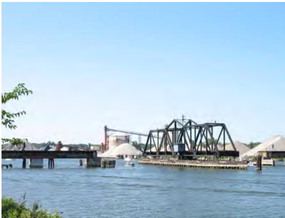
Grand River, Grand Haven Metal Truss Swing Railroad Bridge

The Detroit, Grand Haven and Milwaukee Railroad which from Detroit to Grand Haven was completed in 1858 and later purchased by the Grand Trunk Railroad. The passenger depot was constructed at the end of Washington Street in 1870. The railroad was later purchased by the Grand Trunk Railroad. The railroad contracted with steamship companies to transport freight across Lake Michigan to Milwaukee until 1883 when it decided to operate its own railroad car ferry. In 1903 the Grand Haven ferry docks were completed and the Grand Trunk Railroad put its car ferry into operation. The Grand Trunk ferry was moved to Muskegon in 1936.