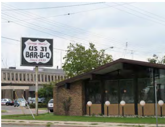
151 W. Muskegon Avenue, Muskegon U.S. 31 Bar-B-Q

The church was founded in 1875 by Swedish and Finnish immigrants.