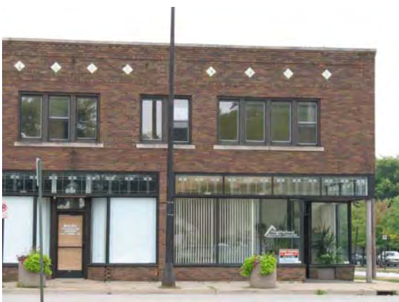
1117 Third Street, Muskegon MAISD Transition Center