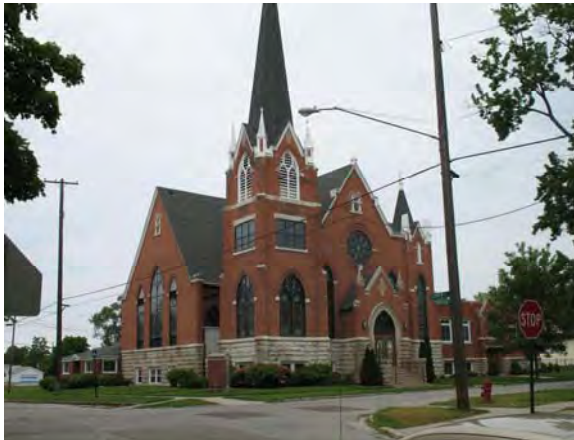
540 Houston, Muskegon Samuel Lutheran Church