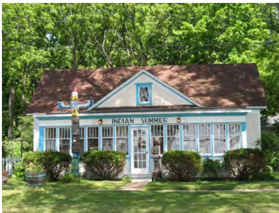
800 Lake Street, Saugatuck Indian Summer