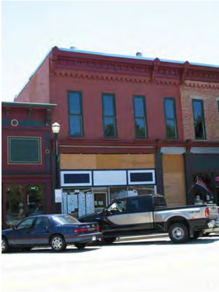
8700 Block Ferry Street, Montague Commercial Building