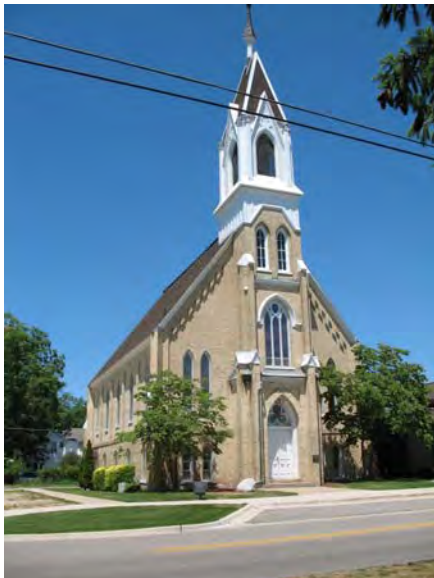
8637 Old Channel Trail, Montague Ferry Memorial Reformed Church (Heritage Hall)