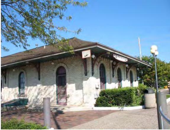
1 North Harbor, Grand Haven Tri-Cities Museum

The railroad depot was built by the Grand Trunk Railroad in 1870.