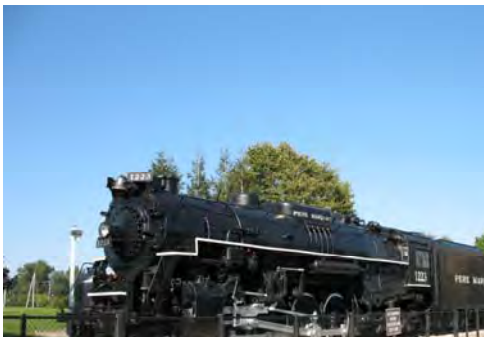
N. Harbor Drive, Grand Haven Shay Locomotive

The Shay Locomotive was built in 1882 and served the Cutler and Savidge Lumber Company.