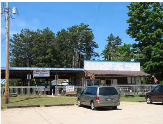
6495 Blue Star Highway, Saugatuck Saugatuck Dune Rides