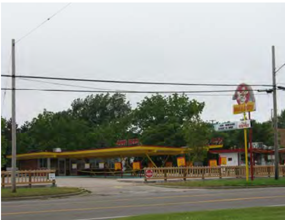
4221 Grand Haven Road, Muskegon Airline Dog 'n Suds

motorist traveled. Soon other oil companies adapted Teague's radical design and it came to dominate the American landscape throughout the 1940s and 1950s.