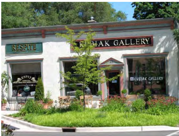
38 Center Avenue, Douglas Respite Cappucino Café