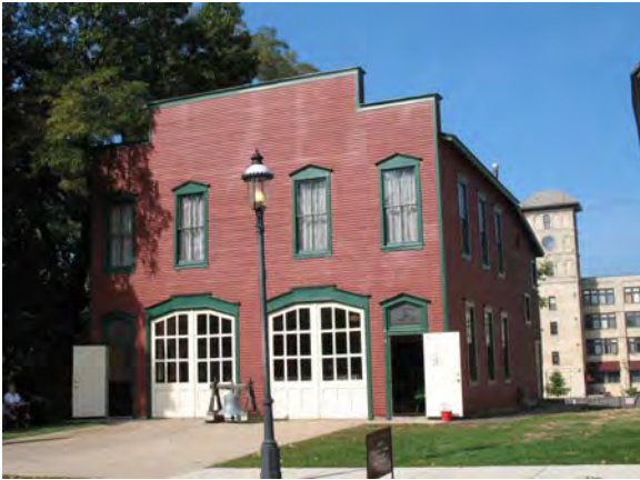
502 W. Clay, Muskegon Fire Museum

This firehouse is a re-creation of the original Hackley House Company #2 that operated in Muskegon between 1875 and 1892. The re-created firehouse was built in 1976 during the Bicentennial.