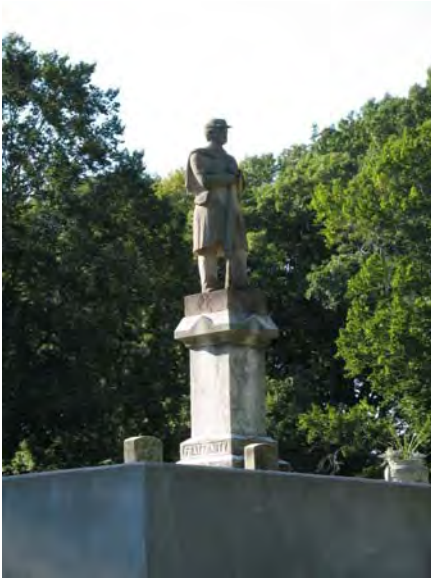
1304 Lake Avenue, Grand Haven Lake Forest Cemetery