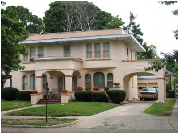
Peck Street, Muskegon Residence