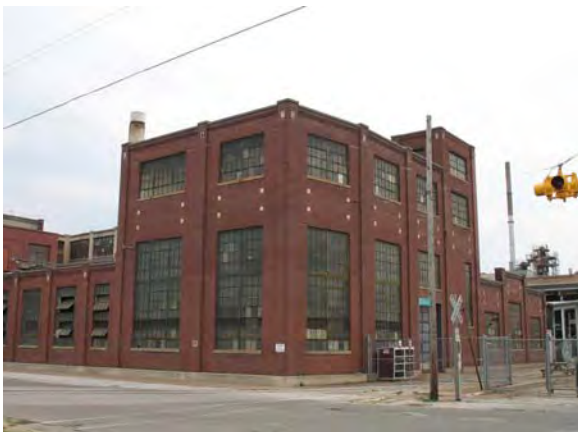
Peck Street at Keating, Muskegon Heights

This former Texaco gas station building is an example of a revolutionary new building design introduced in 1936. The design was developed by Walter Dorwin Teague, a pioneer in industrial design, and was used by Texaco until the 1960s.