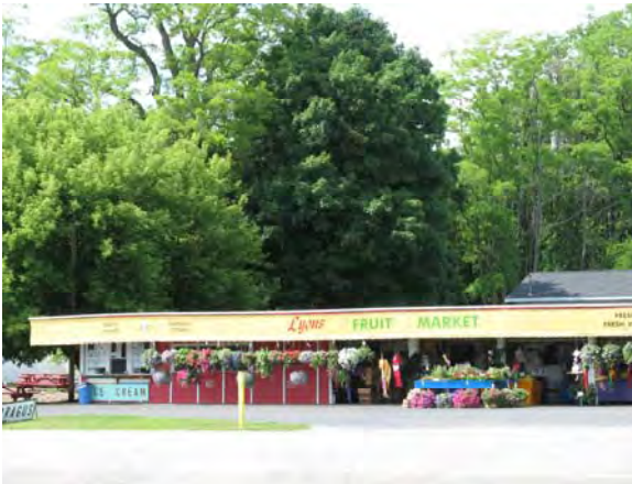
6821 124 th Street, Saugatuck Lyon's Fruit Market