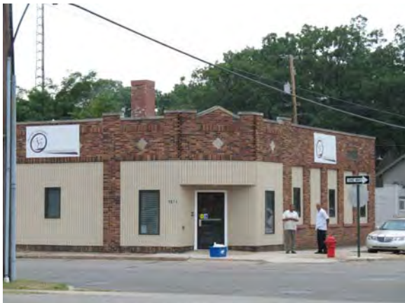
1871 Peck Street, Muskegon Disability Connection