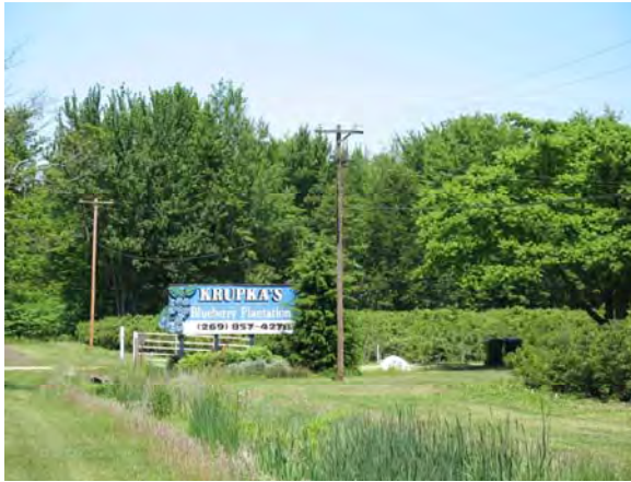
Blue Star Highway Krupka's Blueberry Plantation