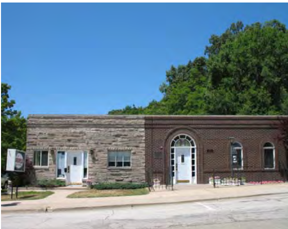
8779 Ferry Street, Montague The Arrowhead Agency (Far right)