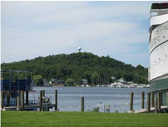
Lake Kalamazoo, Blue Star Highway, Saugatuck