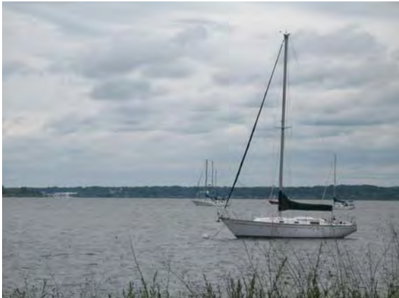
6806 South Shore Drive, Whitehall South Shore Marina