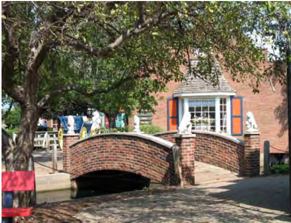
12350 James Street, Holland Nellis' Dutch Village