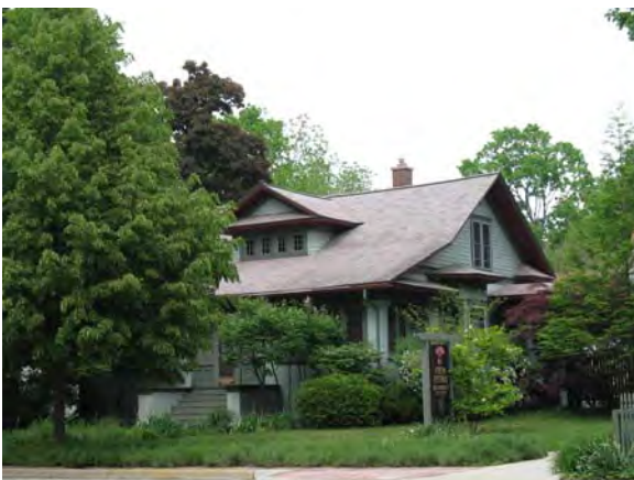
233 S. Mears, Whitehall Cocoa Cottage