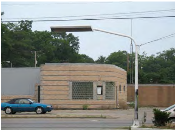
N. W. Corner Peck Street at Sherman, Muskegon Heights Art Moderne Commercial Building