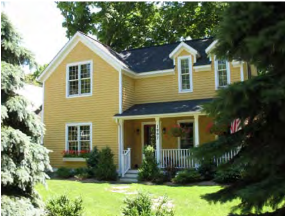
1007 Holland, Saugatuck Residence