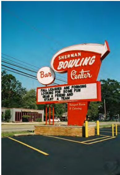
1531 Sherman, Muskegon Sherman Bowling Center