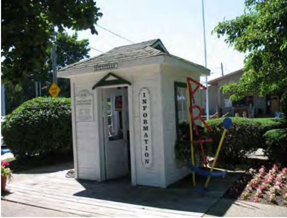
Butler Street, Saugatuck Interurban Shelter

On August 19, 1899, the Holland and Lake Michigan Railroad Company began service to Saugatuck. The service connected Saugatuck to the city of Holland and the resorts on Lake Macatawa.