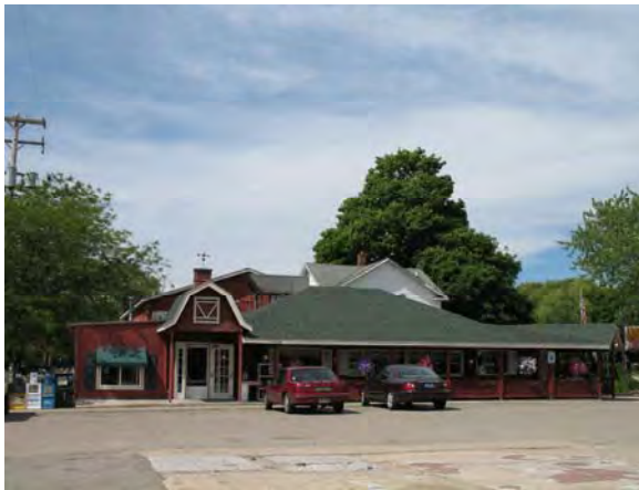
312 Ferry, Douglas Kalico Kitchen Restaurant