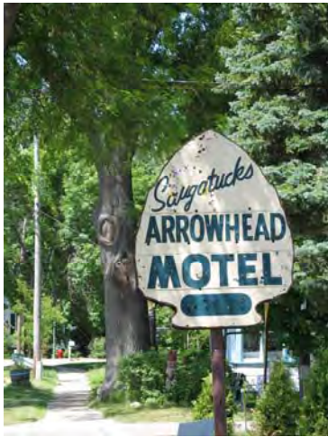
842 Lake Street, Saugatuck Arrowhead Resort

Built in the 1940s, this was a popular post World War II resort.