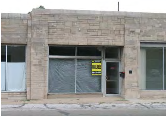
1845 Peck Street, Muskegon Stone Commercial Building