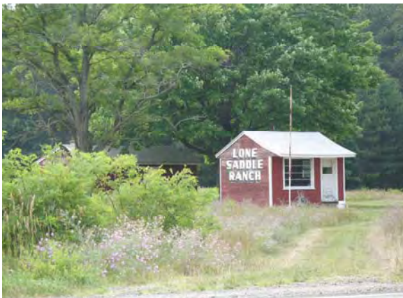
Lone Saddle Ranch Sign, Whitehall Whitehall Road