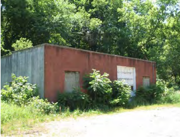
Lake and First Streets, Whitehall Utility Building near Trestle Bridge