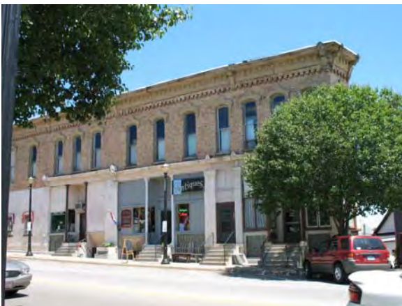
4586 Dowling, Montague Montague Antique Mall

Two music teachers from the University of Illinois-Champaign created the Dog 'n Suds drive-in restaurant chain in 1953. The business was an overnight success and by the 1970s there were over six hundred Dog 'n Suds franchises located in thirty-eight states. Today only sixteen Dog 'n Suds locations are still in operation—two are in Michigan. The proprietor of Montague's Dog 'n Suds also owns the drive-in on Grand Haven Road in Ottawa County.