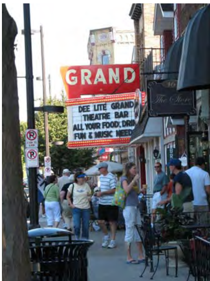
22 Washington Avenue Grand Theater