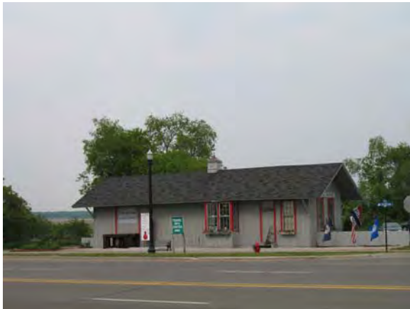
124 W. Hanson, Whitehall White Lake Chamber of Commerce

The Chicago & Michigan Lake Shore Railroad began construction of a north-south rail line in West Michigan in 1869. The line reached the Muskegon/Pentwater area around 1872. The Panic of 1873 caused the company to declare bankruptcy and reorganize as the Chicago & West Michigan Railroad and begin to acquire feeder lines to the north.