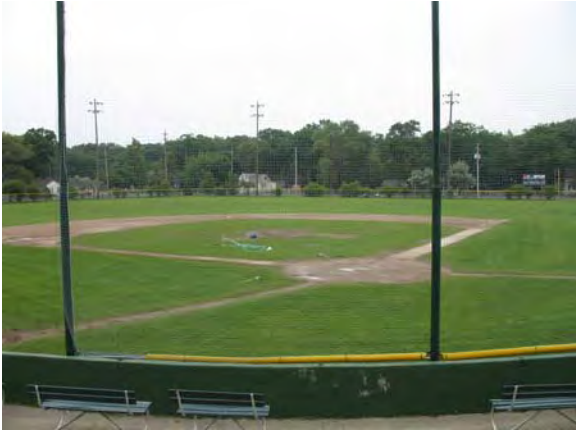
HPeck Street at Laketon, Muskegon C. W. Marsh Field