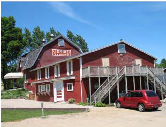
3657 Blue Star Highway, Saugatuck Red Barn Playhouse