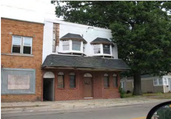
2927 Peck Street, Muskegon Heights Commercial Building