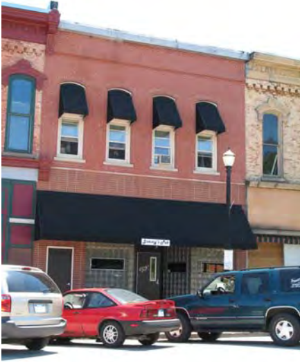
8720 Ferry Street, Montague Jimmy's Pub