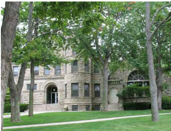
Tenth and College Avenue, Holland Hope College

Originally a woodworking mill and feed store, the building was converted to a theater in the 1920's and called the Colonial Theater. The interior burned in 1935 and the theater was reopened as the Park Theatre in 1936. It closed in 1984.