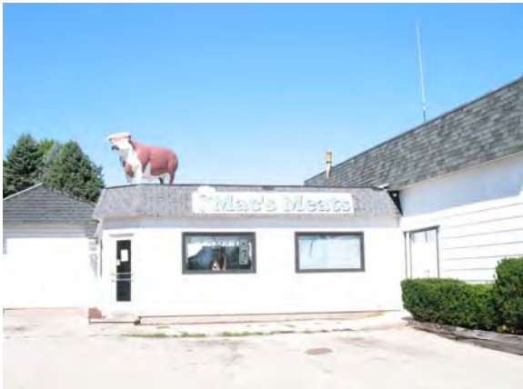
6309 Oceana Drive, Rothbury Mac's Meats

This local meat market was established around 1950.