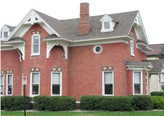
1189 Peck Street, Muskegon Chris Houghling & Associates

The building is an example of Veneklasen brick, the local name given to the polychromatic brickwork that decorates over one hundred buildings in Allegan and Ottawa Counties. The brick work is associated with Dutch immigrants that settled the area in the late nineteenth century.