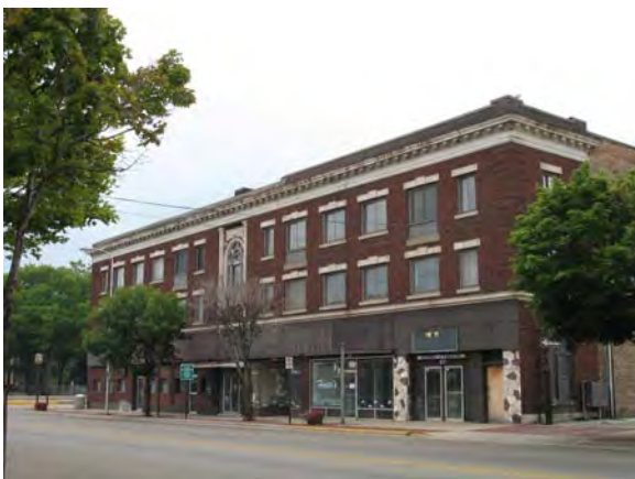
22 Broadway, Muskegon Heights Strand Theater