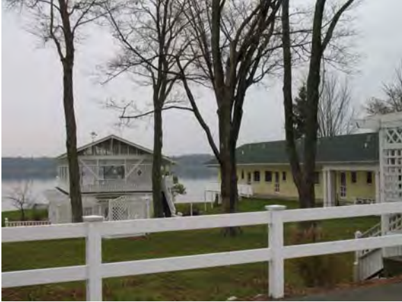
6235 Old Channel Trail, Montague White Sands Resort