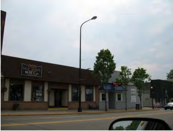
107 W. Colby, Whitehall Pitkin Sale Shoppe