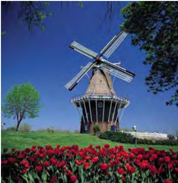
777 Lincoln Avenue, Holland Windmill Island