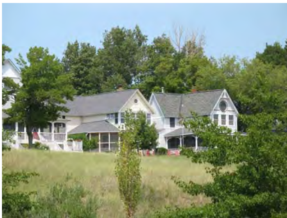
Ottawa Beach Road, Holland Ottawa Beach Resort