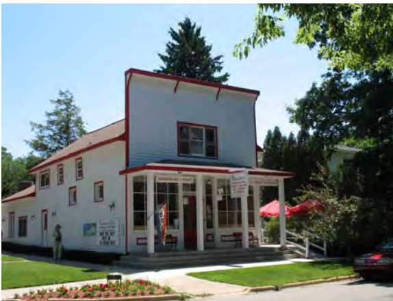
503 S. Mears, Whitehall Peckadill's