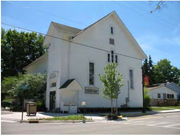
137 Center Avenue, Douglas Saugatuck Douglas Library