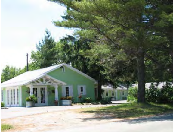
58 Blue Star Highway, Douglas Pines Motor Lodge

Originally the Plaza Tourist Court, a 1950s era motel with little decoration, the motel was completely remodeled in 2004 to reflect the Arts and Crafts style.