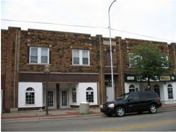
2715 Peck Street, Muskegon Heights Noel Block