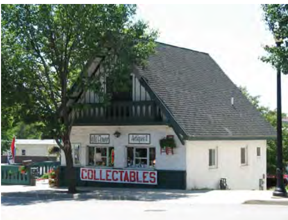
Dowling, Montague Wildflower Antiques II