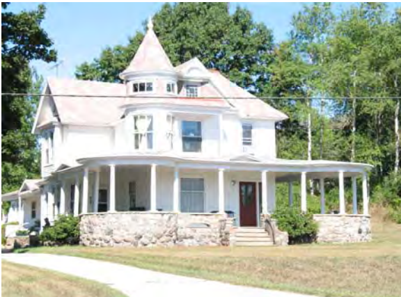
Oceana Drive, Rothbury Queen Anne Residence

This local meat market was established around 1950.