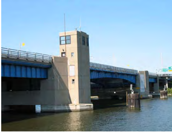
U.S. 31 over Grand River Bascule Bridge

The plate girder bascule bridge was opened in 1960.