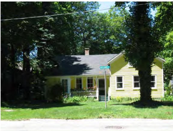
996 Holland, Saugatuck Residence