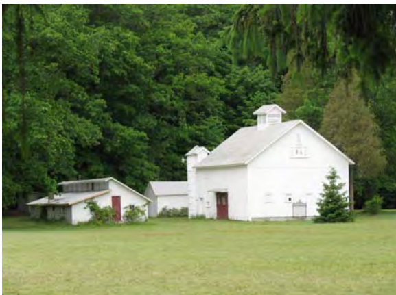
South Shore Drive, Whitehall Farm Buildings

An estate built in 1904 in the Craftsman style.