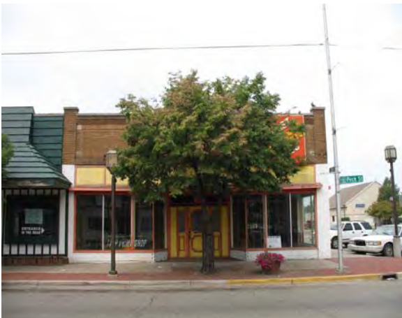
2700 Block of Peck Street, Muskegon Heights Commercial Building