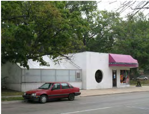
1222 Peck Street, Muskegon Muskegon Flower Girls