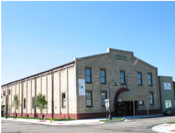
17 S. Second Street, Grand Haven Armory