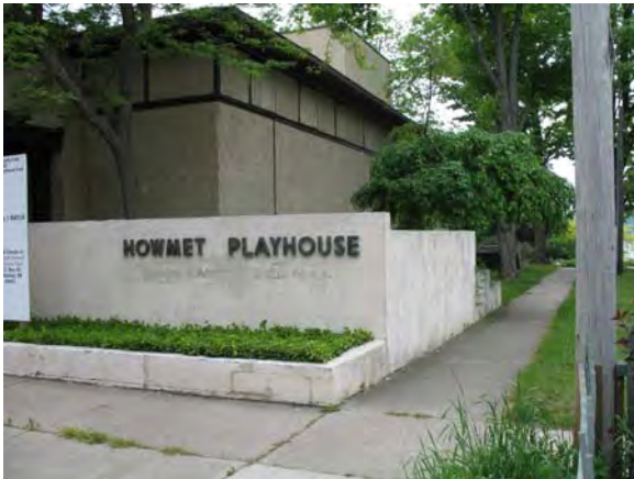
304 S. Mears, Whitehall Howmet Playhouse