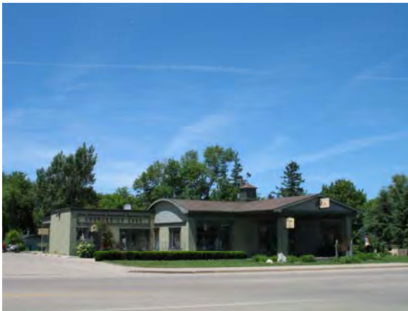
10 Blue Star Highway, Douglas Keller Building

Built in 2000 it is a replica of the former Johnson Gas Station.