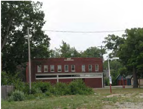
Peck Street, Muskegon The Christansen Building

A commercial building constructed in 1913.