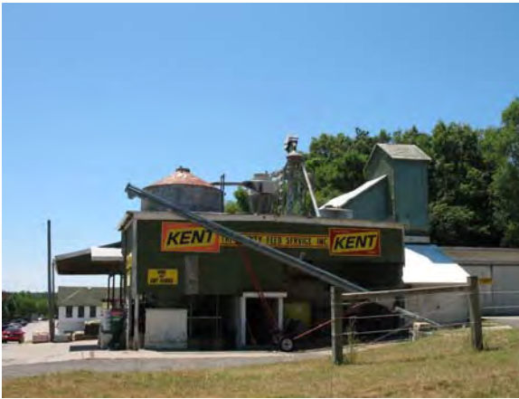
8819 Ferry, Montague Tri-County Feed Service

The feed service was established in 1951.