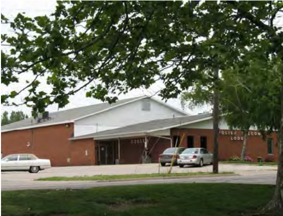
1014 W. Hackley, Muskegon Polish Falcon Lodge

The church was established in 1912 to serve the city's Polish population.