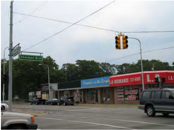
2544 Peck Street, Muskegon Heights Commercial Strip