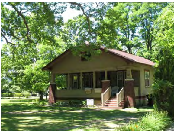
612 Holland Street, Saugatuck Residence