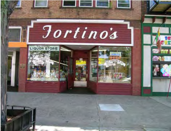
114 Washington Street Fortino's