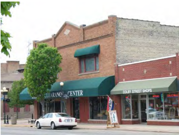
104 E. Colby, Whitehall Bell's Clearance Center

This commercial building was built in 1913.