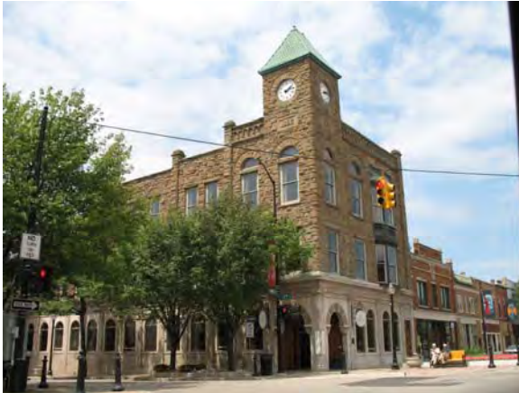
River and Eighth Streets, Holland Clock Tower Building

The building demonstrates the Flemish architectural influences of Holland's commercial buildings.