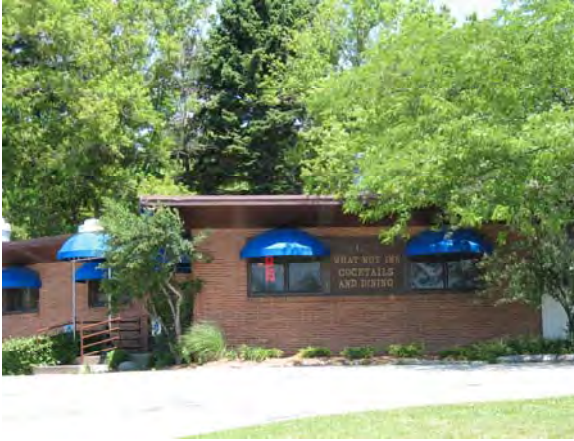
2409 68 th Street, Fennville What Not Inn