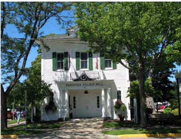
102 Butler Street, Saugatuck Saugatuck Village Hall

On August 19, 1899, the Holland and Lake Michigan Railroad Company began service to Saugatuck. The service connected Saugatuck to the city of Holland and the resorts on Lake Macatawa.