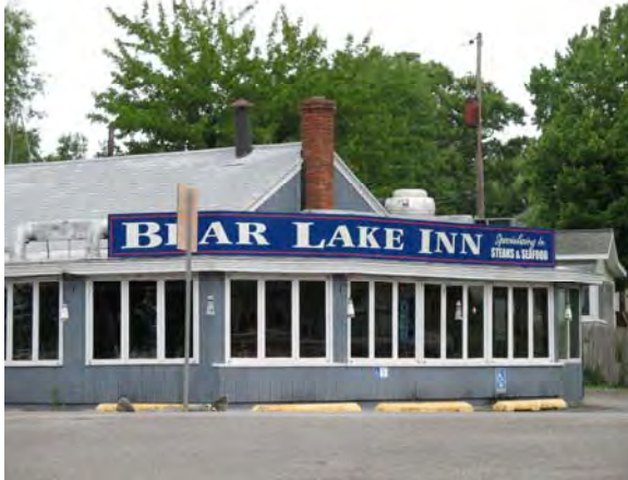
360 Ruddiman, North Muskegon Bear Lake Inn