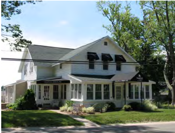
787 Lake Street, Saugatuck Saugatuck Harbor Inn