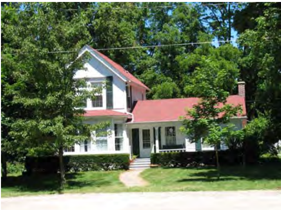
290 Francis, Saugatuck Residence