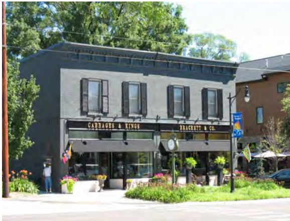
36 Center Avenue, Douglas Cabbages and Kings