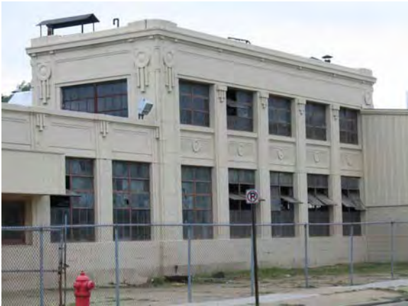
1901 Peck Street, Muskegon Dymet Corporation

A classic neon "Eat" sign at the site of a former restaurant.