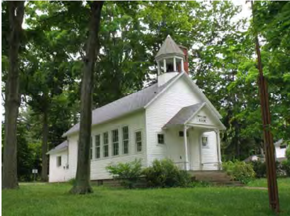
White Lake Community Club, Whitehall South Shore Drive