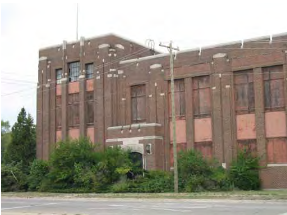
Peck Street at Henry, Muskegon Heights Campbell, Wynant & Cannon Foundry

Three businessmen from Chicago started a foundry in Muskegon in 1908. They built a new facility on Peck Street in 1922. The foundry was critical to the United States' World War II military production and at one